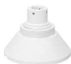
WV-QSR506S-W Mount Bracket