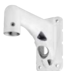
WV-QWL501S-W Wall Mount Bracket