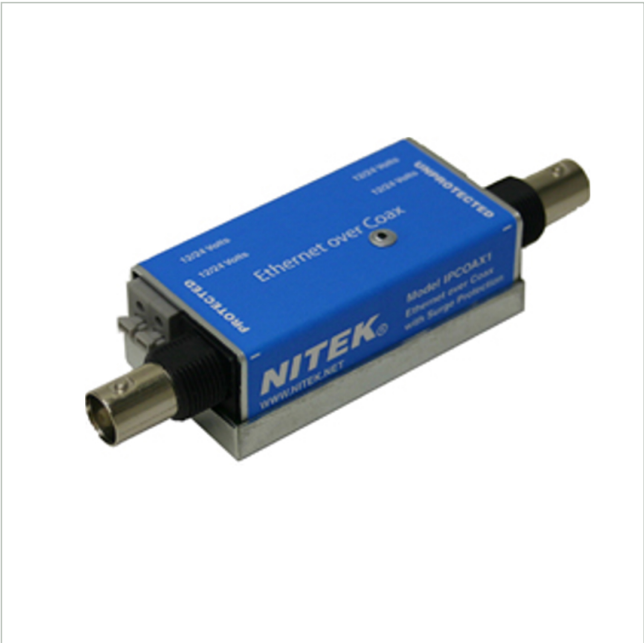
IP Ethernet over Coax Surge Protector, Single Channel